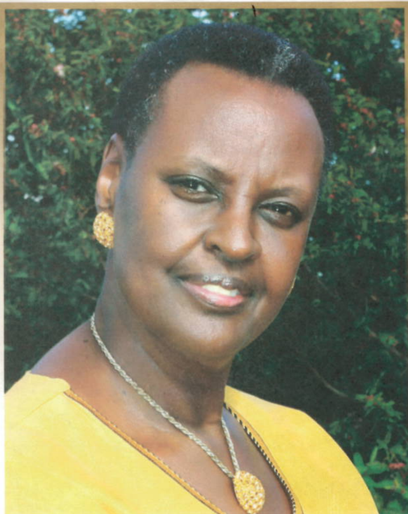
Hon. Janet Kataaha Museveni FIRST LADY AND MINISTER OF EDUCATION AND SPORTS