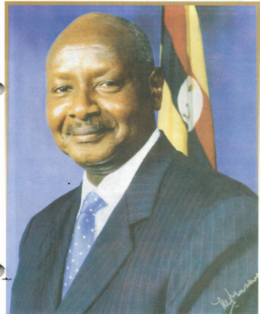
His Excellency Gen. Yoweri Kaguta Museveni The President of the Republic of Uganda and Visitor of Busitema University