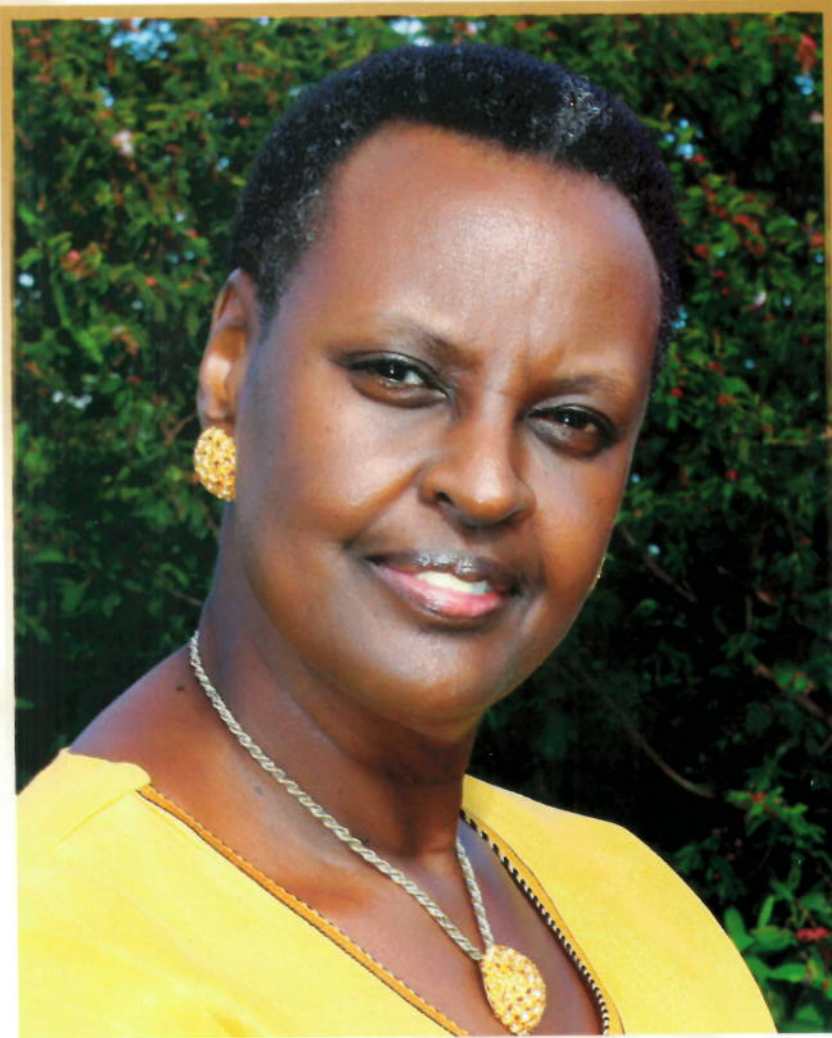
Hon. Janet Kataaha Museveni MINISTER OF EDUCATION AND SPORTS