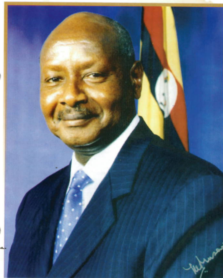
His Excellency Lt. Gen. Yoweri Kaguta Museveni The President of the Republic of Uganda and Visitor of Busitema University