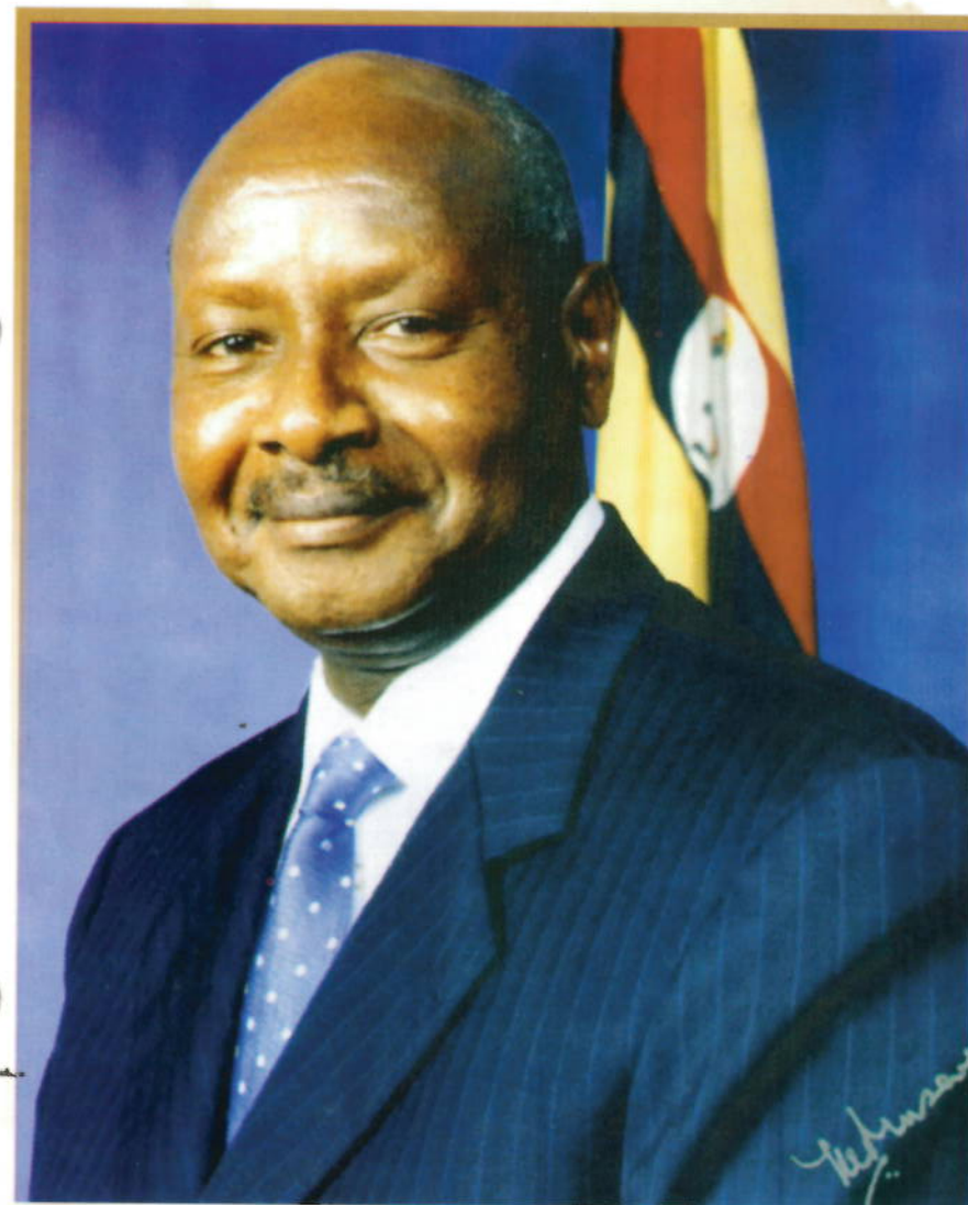
His Excellency Lt. Gen. Yoweri Kaguta Museveni The President of the Republic of Uganda and Visitor of Busitema University