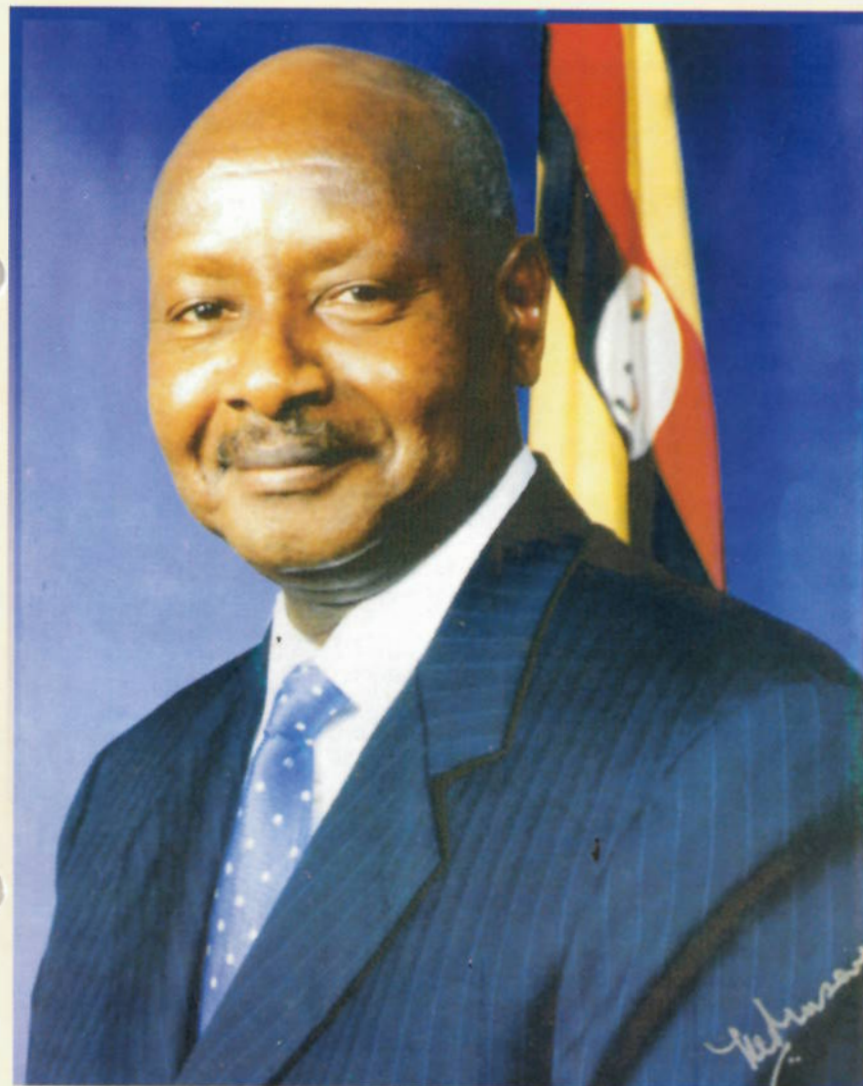
His Excellency Lt. Gen. Yoweri Kaguta Museveni The President of the Republic of Uganda and Visitor of Busitema University