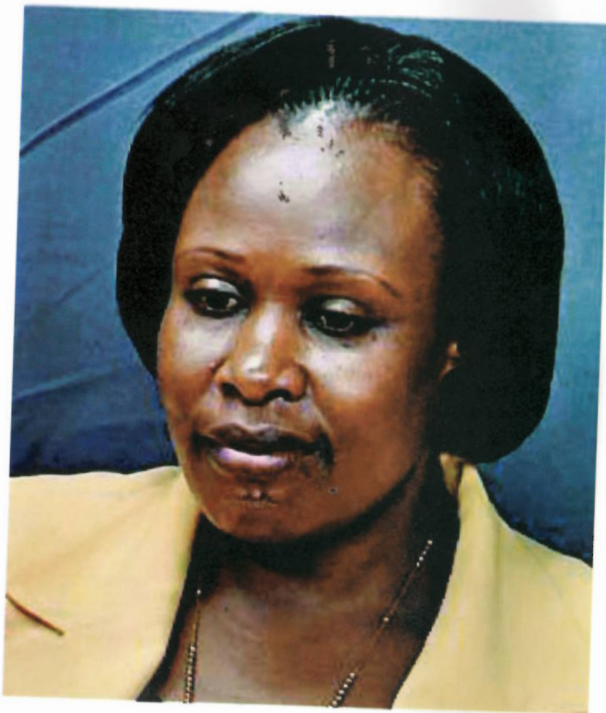
Hon. (Rtd. Maj) Jessica Alupo (MP) MINISTER OF EDUCATION AND SPORTS