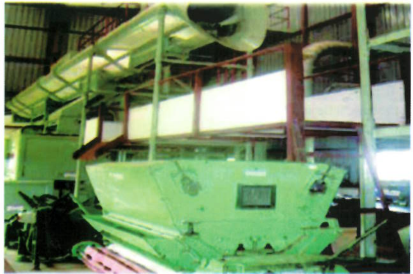
Busitema University Training Ginnery