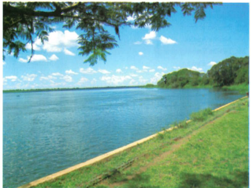
One of the beautiful views of Namasagali Campus