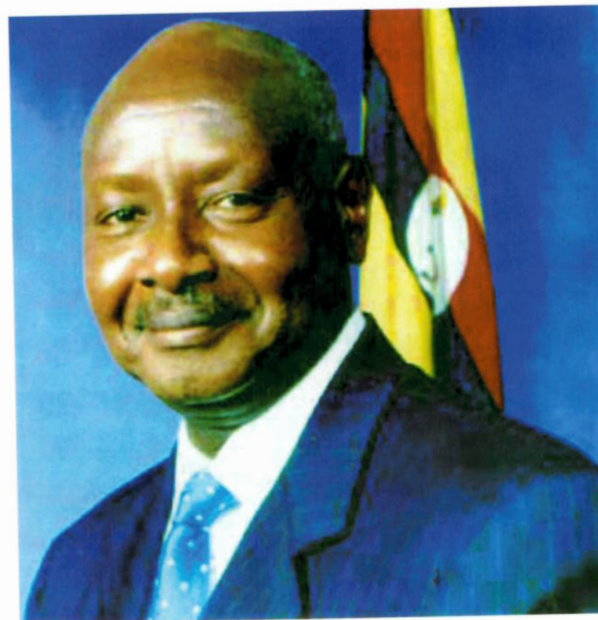
His Excellency Lt. Gen. Yoweri Kaguta Museveni THE PRESIDENT OF THE REPUBLIC OF UGANDA AND VISITOR OF BUSITEMA UNIVERSITY

BBA(MUK), MBA (Finance), CPA (Uganda), CIA