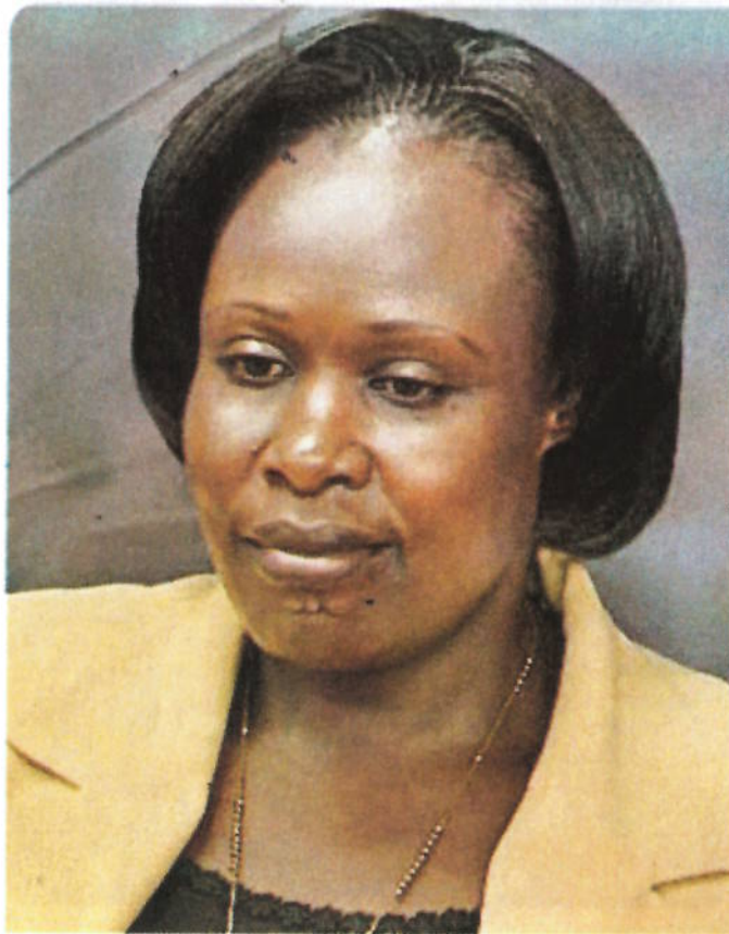
Hon. (Rtd. Maj) Jessica Alupo (MP) MINISTER OF EDUCATION AND SPORTS