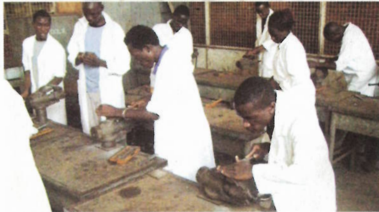
Engineering Students during Practical Sessions at Busitema Campus