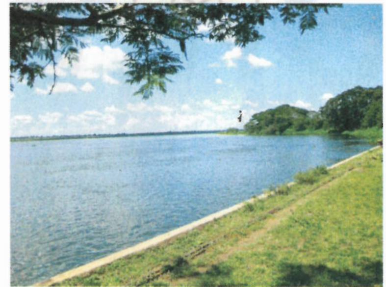
View of River Nile as seen at Namasagali Campus