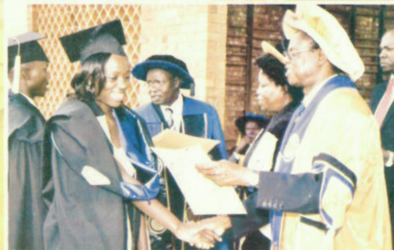
Conferment of Degrees and Award of Diplomas of Busitema University