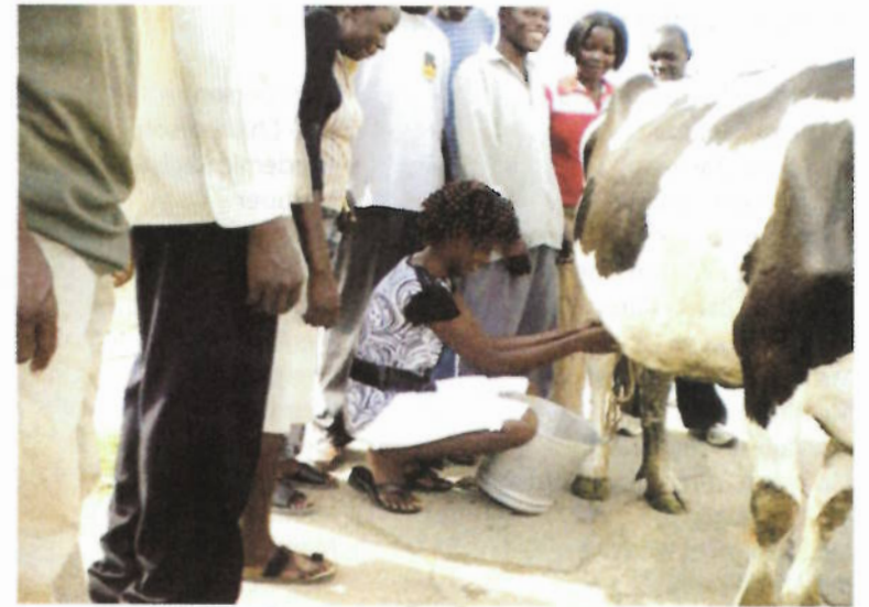
Students in the Milking Practical Class- Arapai Campus