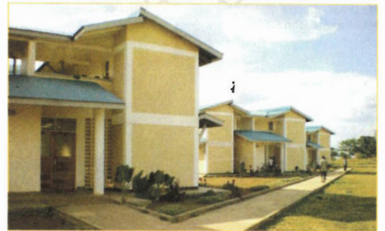
A side view of the Hostels at Arapai Campus