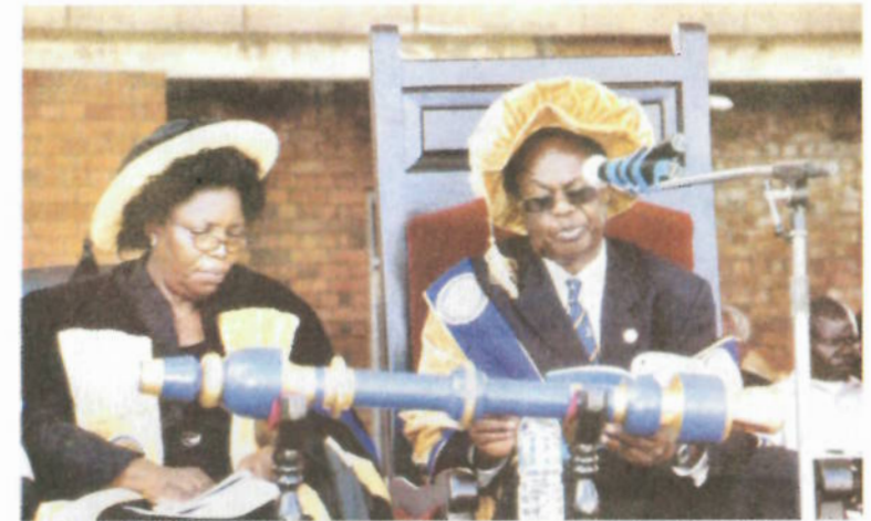
The Chancellor addressing the 2 nd Congregation of Busitema University