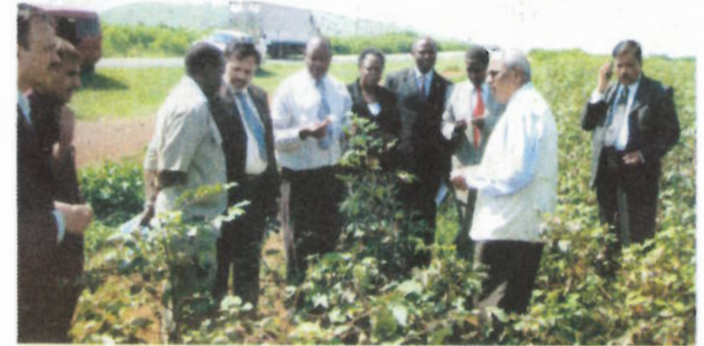
Indian Delegation from DKTE Institute of Technology inspecting the Cotton Fields at Busitema University