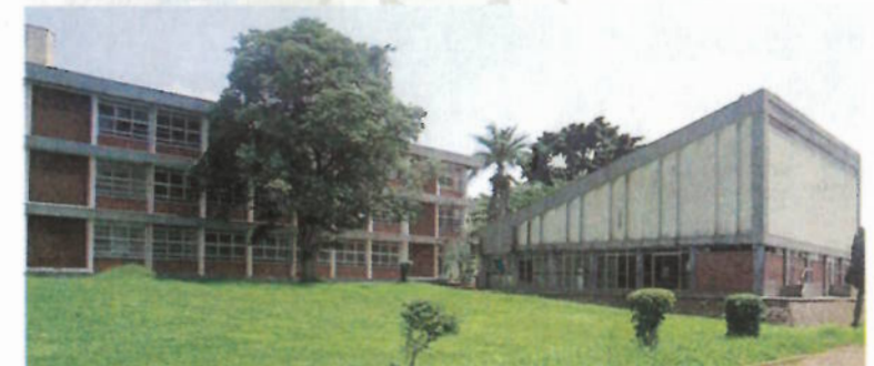
Busitema University Administration Block and Main Hall at Busitema Campus