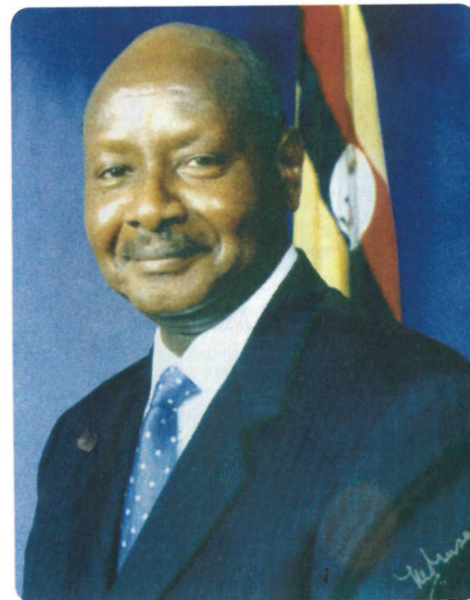
His Excellency Lt. Gen. Yoweri Kaguta Museveni PRESIDENT OF THE REPUBLIC OF UGANDA AND VISITOR TO BUSITEMA UNIVERSITY