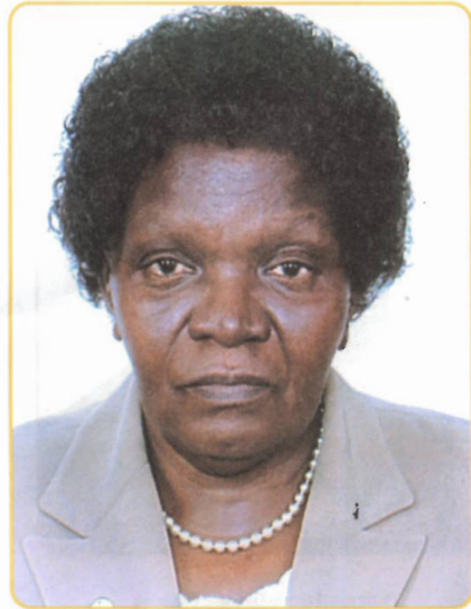
Hon. Geraldine Namirembe Bitamazire (MP) MINISTER OF EDUCATION AND SPORTS