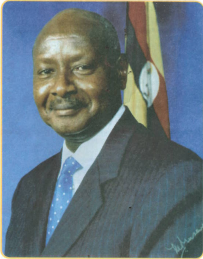
His Excellency Lt. Gen. Yoweri Kaguta Museveni PRESIDENT OF THE REPUBLIC OF UGANDA AND VISITOR OF BUSITEMA UNIVERSITY